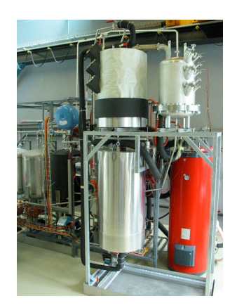
EMPA's liquid sorption reactor with two separate stages.