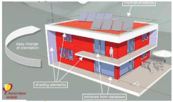
PHPP simulation environment

Dark Green SolarWall on the three walls of Bus garage in New York City