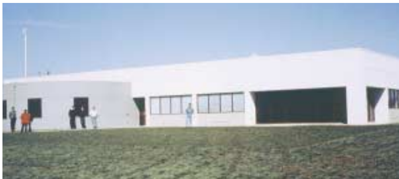
The Energy Resource Station test facility in Ankeny, Iowa is comprised of 4 sets of matched test rooms and a sophisticated HVAC system. This equipment was used to create laboratory quality test data for the empirical validation of building energy analysis tools