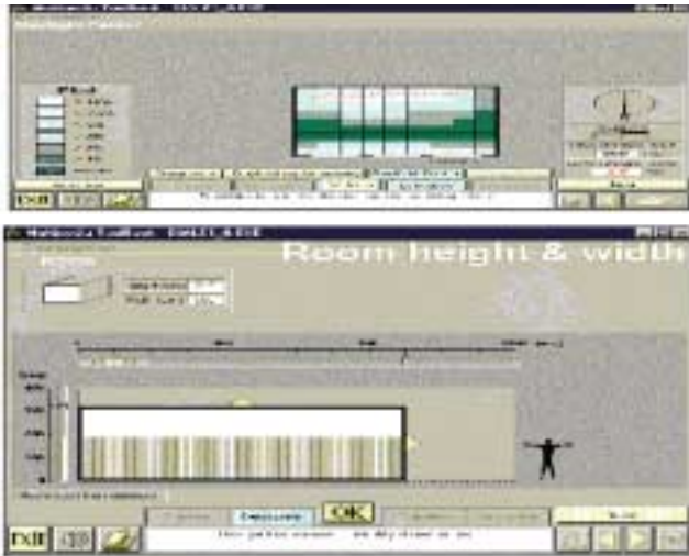
Screen views of the LESO DIAL daylight program showing the menu for room definitions and the calculated daylight factors in the room.