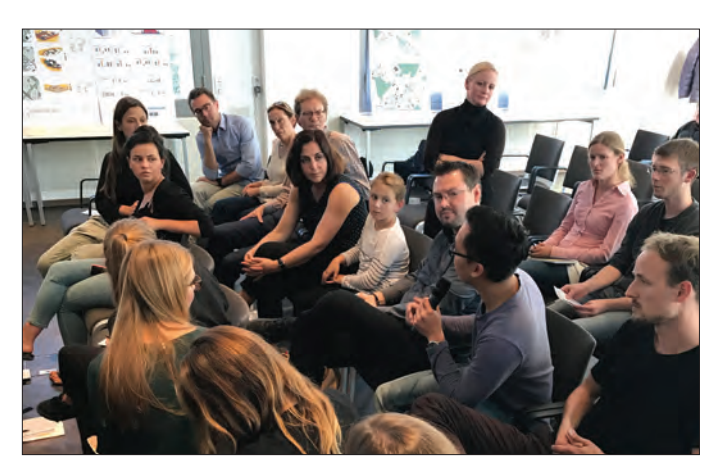
▲ Figure 4. Open Discussion with Students and Experts.