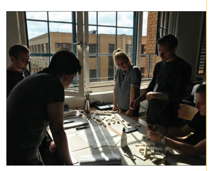
Figure 2. Seminars for interdisciplinary student groups with academic staff.