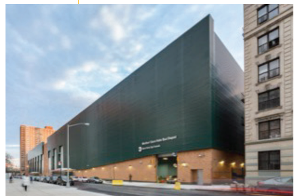
Dark Green SolarWall on the three walls of Bus garage in New York City

The Task's scope is to prepare an overview of multifunctional solar envelope products and systems that are available or near to market, analyzing the conditions for their effective market penetration and discussing these factors with relevant stakeholders, such as technology