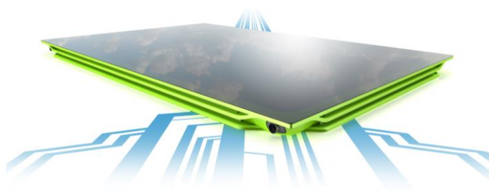
Figure 1: One World Solar Collector (Sketch from Sunlumo)

Recent estimates have shown a steadily rising need for solar collector panels worldwide, from 10 to 15 percent annually. By 2020 the annual demand for collector surface is thought to be around 200 to 400 million square meters. This demand will be met with great difficulty only, if at all, when relying on conventional aluminum or copper panels. Materials for traditional collector panels are scarce and, therefore, too expensive to produce or sell collectors as an affordable mass product. Sunlumo's R&D is geared to bridge this gap between the two poles – of a sufficient raw material supply on the one hand and of low prices for the volume market on the other. Their R&D is thus focused on innovative technologies, new materials such as polymers, and manufacturing options for the mass market.