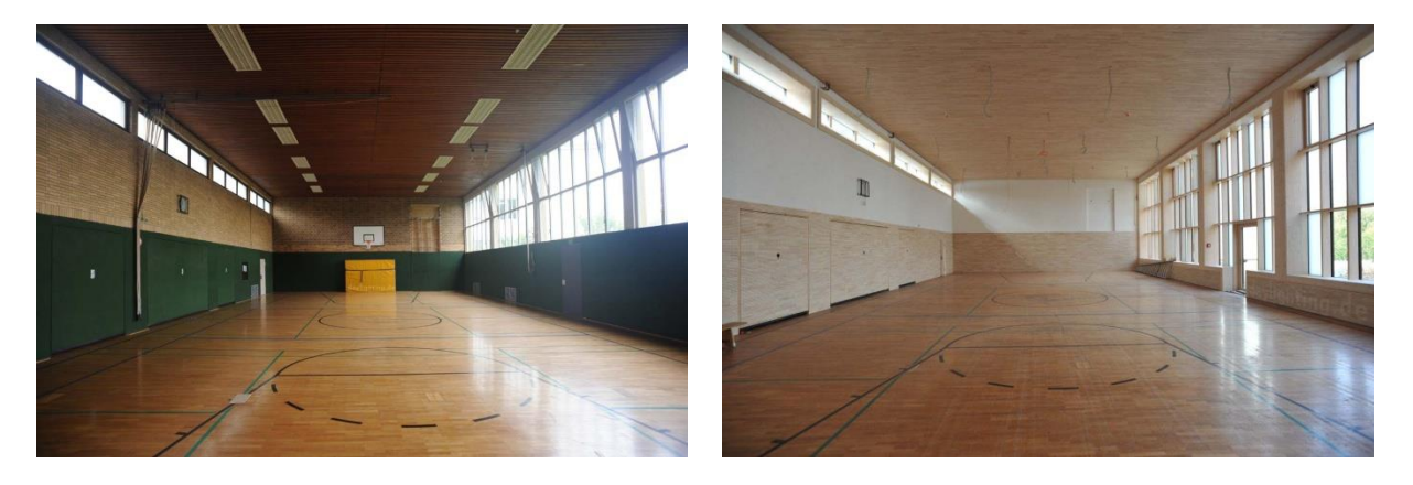
Figure 2: Pre- and post-retrofit of the gym in the vocational college at Detmold

In four of the case studies examined the existing façade was removed and replaced with a new facade. The motivation for the installation of a new facade was primarily to improve the thermal performance of the façade. In the PowerHouse Kjørbo in Sandvika the transparent glass area could be increased slightly by the renovation. In the case of the gymnasium of the vocational college in Detmold the lower part of the façade that was closed by a baffle wall before renovation then was opened. This was possible because the hall is used after renovation no longer for ball sports but as gymnastics hall. The opening of the lower façade region conducted here to an increase in glass area of 38% compared to the facade before refurbishment. In the case of the classroom at the vocational colleges in Detmold and in the case of the classrooms in the attic of the school in Olbersdorf installing a new facade led to a reduction of the glass area as compared to the state before renovation. In Olbersdorf reducing the transparency of the facade was compensated by an additional skylight. In most of the case studies in which the existing facade was replaced by a new facade, triple thermal insulation glazing was installed instead of an uncoated double glazing before refurbishment. In the case of the gym in the vocational college of Detmold in the north façade a single glazing was replaced by triple glazing. The light transmission of the glazing is thereby reduced.