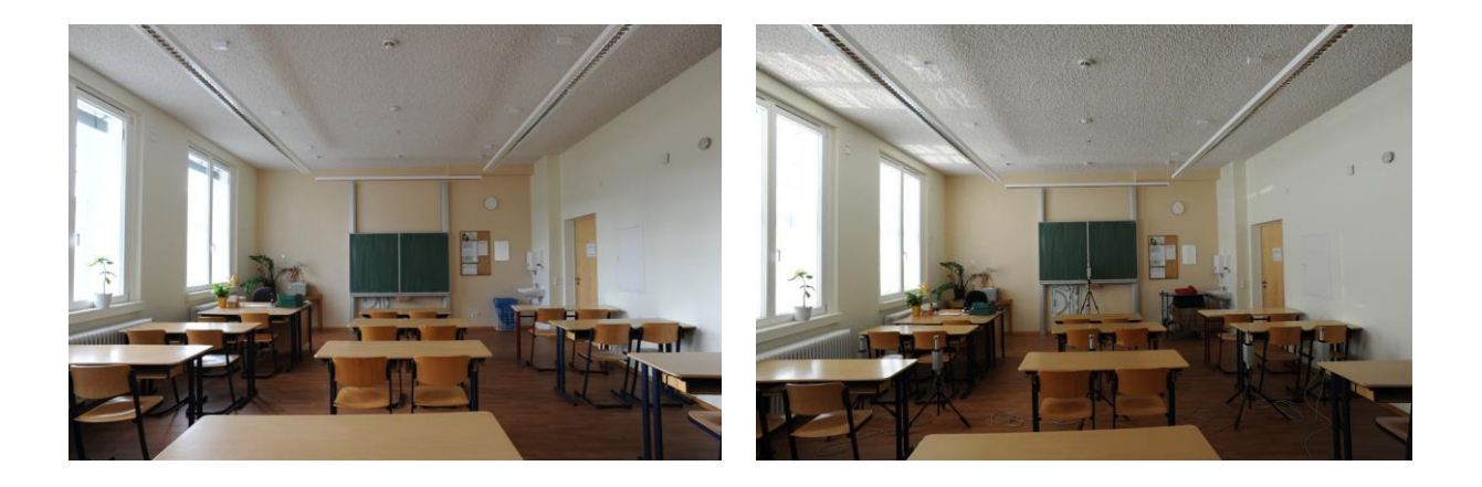
Figure 4: Interior view of Classroom in the Friedrich-Froebel-School under overcast sky (left) and sunny sky with light-directing blinds (right).

Innovative control systems regulate the daylight devices and the electric lighting systems based on comfort and energy efficiency in the building. In the classrooms of the Friedrich-Froebel-School in Olbersdorf such an advanced control strategy was applied. The button "lighting", triggers the activation of controls regarding facade systems and electric lighting. Specifically, this means that compliance with the target illuminance is ensured in the space. This is achieved by the opening of the blinds and adding electric light in case needed. If direct sunlight hits the facade and people are present in the space the louver blinds are moved in a position that no direct sunlight falls into the classroom. Thus, the basic functionality of lighting is delivered, if one activates the button "lighting". Other functions are delivered without intervention of the users. For example if the thermal shading is active the slat angle opens a bit if a person enters to room in order to allow some daylight to penetrate the space.